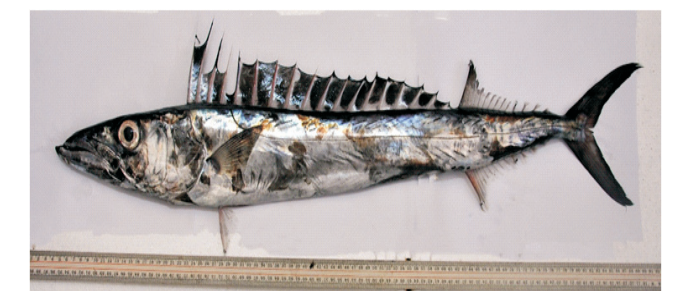
Figure.1: Photograph of Thyrsitoides marleyi Fowler, 1926