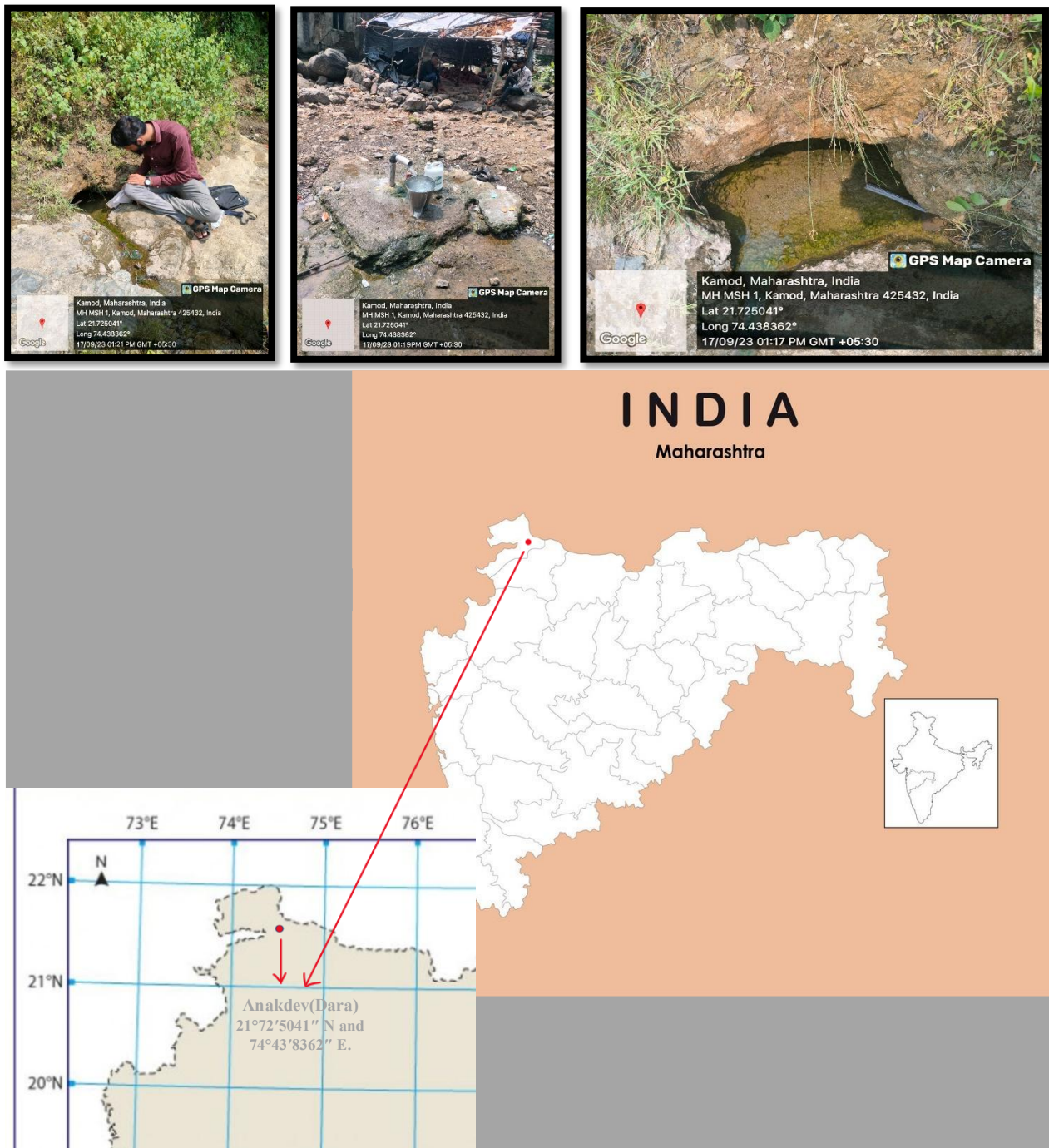
Fig No-01 This figure shows the location of the study area at Anakdev (Dara) Hot Spring, situated in North Maharashtra, India.