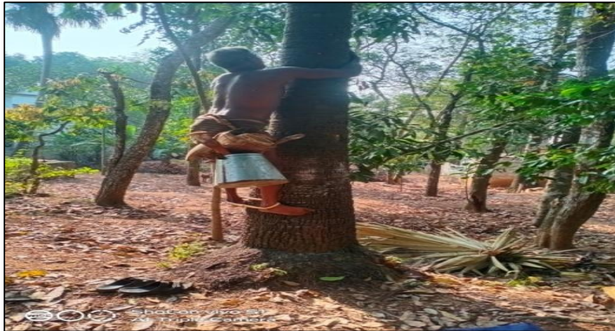
Figure 1. Collection of Palmyra Sap sample

head of the inflorescence. In rural areas, palm sap was traditionally collected from Palmyra trees by organized practice for its local consumers.